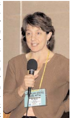
Dr. Marla Spivak

the nation to pollinate crops for our nation's food supply face extreme difficulties in supplying bees that are strong and healthy enough for pollination. Often, a large number of bee colonies are required to pollinate a particular crop. For example, over 1 million bee colonies are required to pollinate almonds in California during late February and March. Moving such large numbers of colonies into a relatively small area places even more stress on bees. In these conditions, the bees may become nutritionally stressed, they may be at increased risk of pesticide exposure, and definitely are at increased risk of disease and mite transmission among colonies.